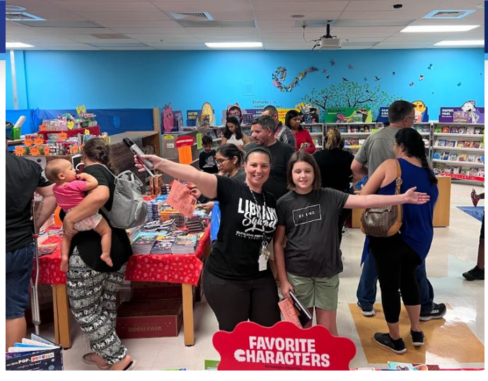
CARDBOARD NIGHT / BOOK FAIR FY24